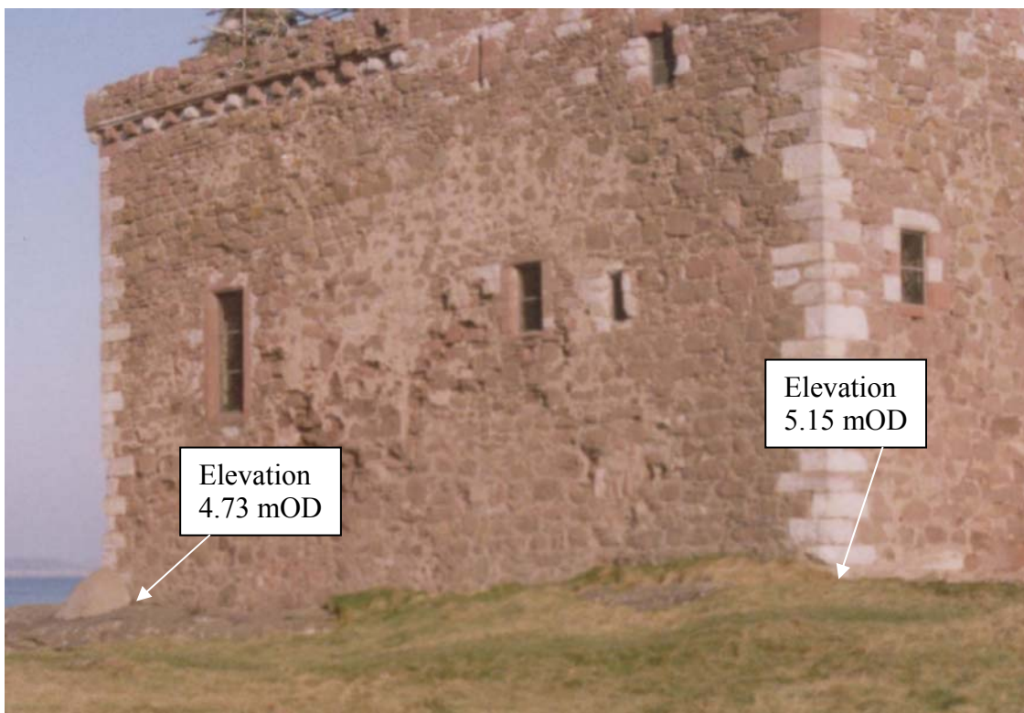
Figure 2 Levels at base of southwest wall of castle